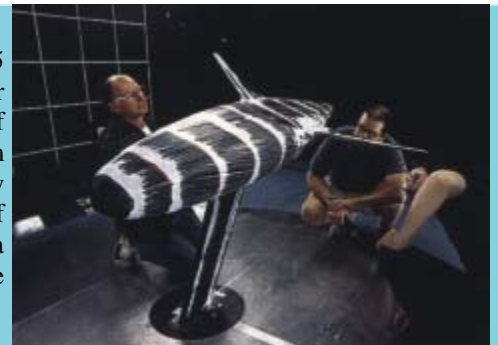
Two PACT95 Engineers inspecting an early hull design of Young America in a Wind Tunnel